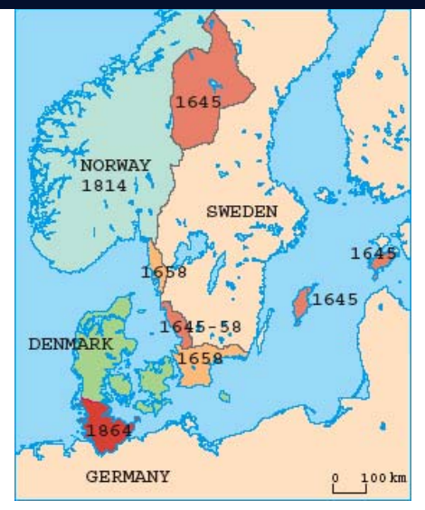
Permanent cedings of Danish territory from the 17<sup>th</sup> to the 19<sup>th</sup> centuries.

war, changed the Danish Church into a Lutheran princely church. Denmark thus joined the Protestant side in the lengthy religious wars which ravaged Europe until 1648. Internally, the new State Church became a tool for ideological and moral indoctrination of the population by the greatly strengthened central power.